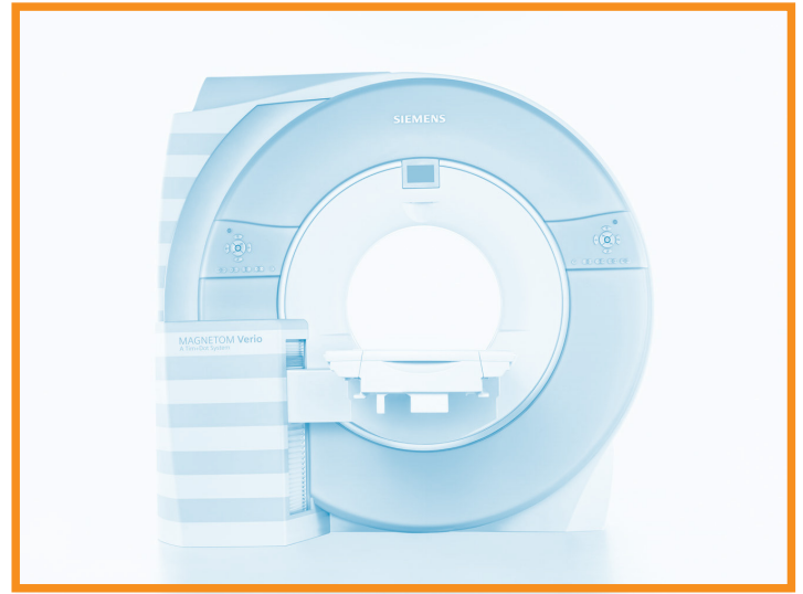
3T Widebore Siemens Verio